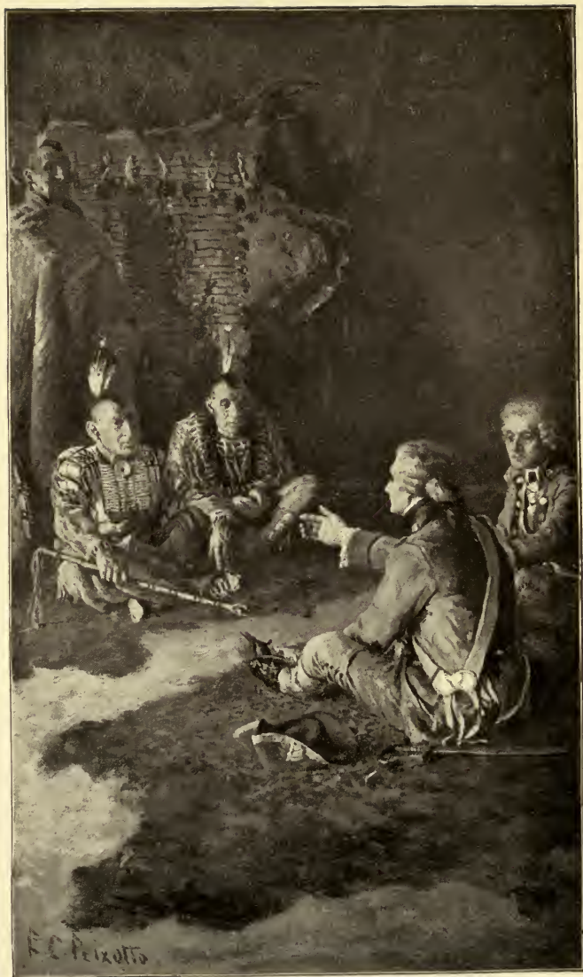
“The officers expressed their earnest remonstrances.” (See page 198.)